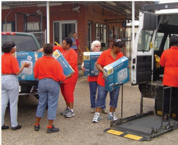
Libbey Glass kicks off the Fan Drive for 2008 - donating 75 fans.